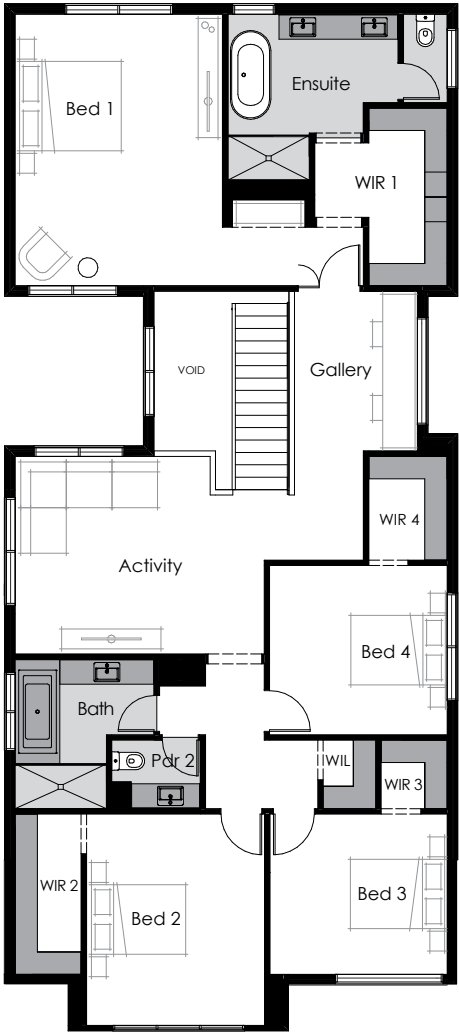
▲ First Floor

Images are for illustrative purposes only and may depict upgrade finishes, materials or options. Work is exclusively owned by Thomas Archer Homes and cannot be reproduced or copied, either whole or in part, in any form (graphic, electronic and mechanical including photocopying) without the written permission of Thomas Archer Homes.