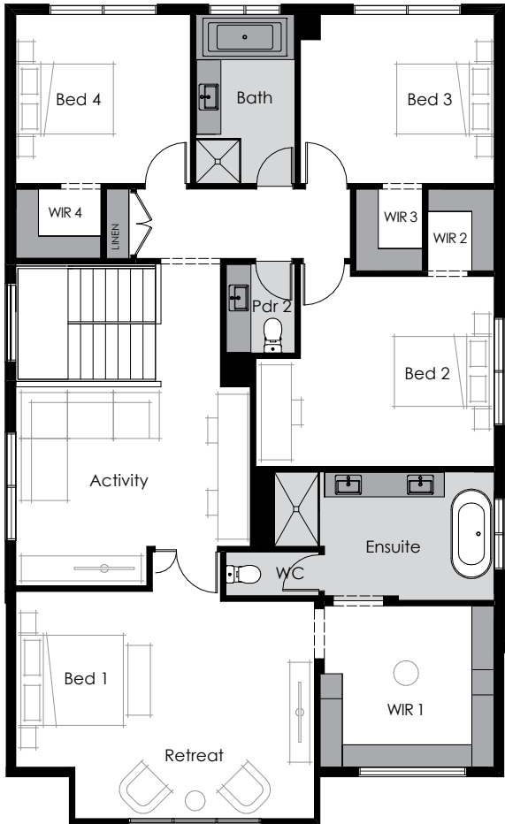
▲ First Floor