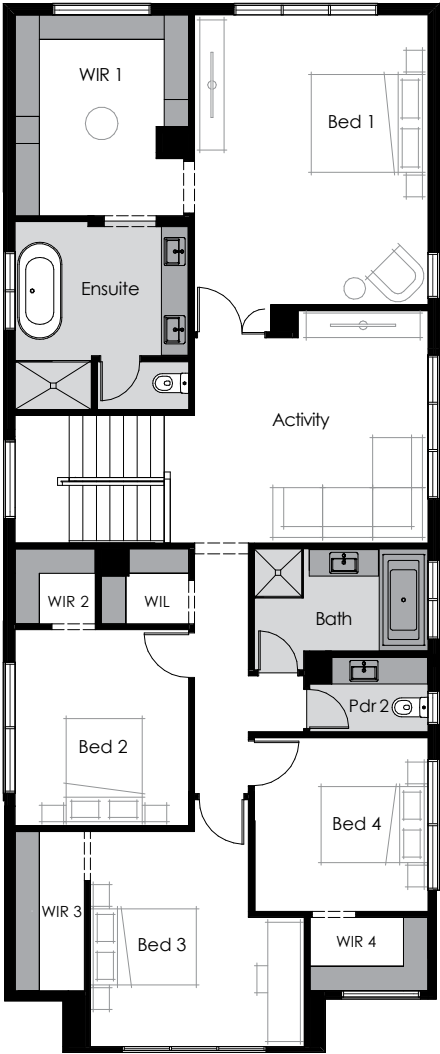
▲ First Floor

Images are for illustrative purposes only and may depict upgrade finishes, materials or options. Work is exclusively owned by Thomas Archer Homes and cannot be reproduced or copied, either whole or in part, in any form (graphic, electronic and mechanical including photocopying) without the written permission of Thomas Archer Homes.